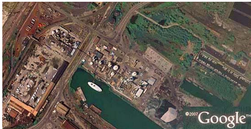
Aerial View of U.S Steel Great Lakes Works